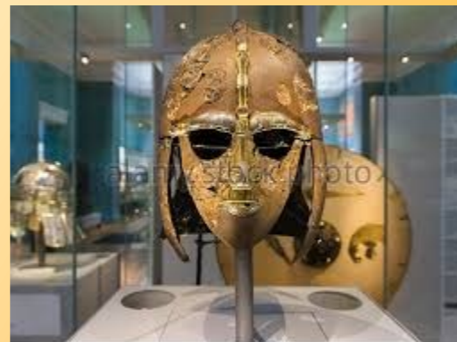
Raedwald helmet in the museum

from Anglo Sax-on times was discovered. It contained a wealth of arte-facts including the Raedwald Helmet. In the British museum the children saw this helmet, a lyre and the cutlery that was used in their feasts. They then had to write a news page about Sutton Hoo. They also created their own model of an archeological dig and their own boats out of cereal boxes.