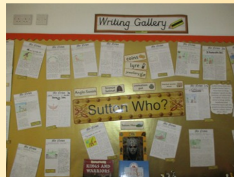
The Sutton Hoo class display

Year 4 have studied hard this term; learning about Sutton Hoo and going to the British Museum. Sutton Hoo is a place in East Anglia where an undisturbed ship