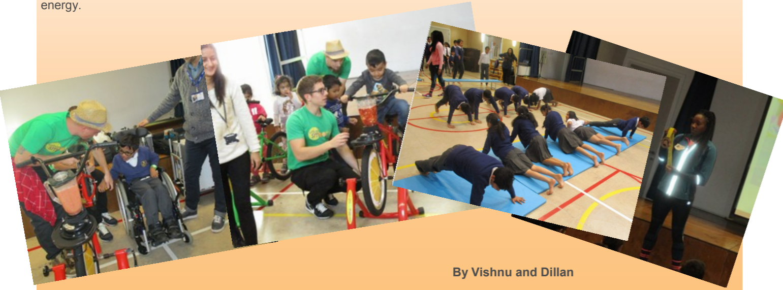
By Vishnu and Dillan

As part of science week, smoothie bikes were a big hit! Every pupil had a chance to ride a bike to make a smoothie with their favourite fruits and later get to drink their hard work! The lesson of this fun activity was to show that when you cycle you create energy.