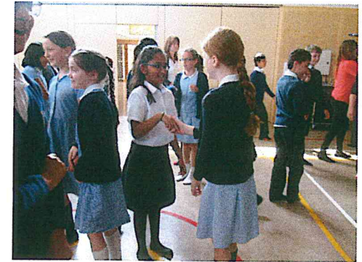
Year 5 welcomed Sacred Heart Catholic Primary School here at KAPS as part of their link school project.