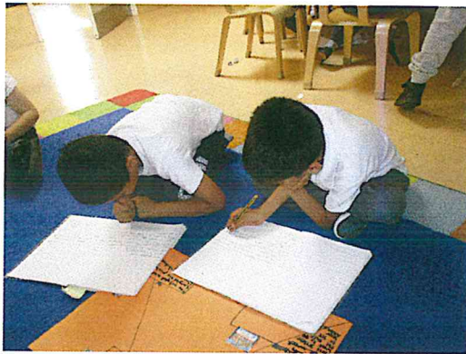
Year 1V are making story boards in Literacy.