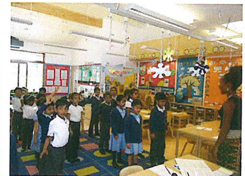
Year 1H are reciting the poem 'Many Shades of Blue.'