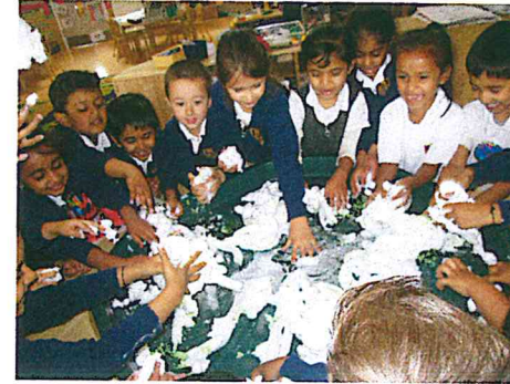
Reception 1 are exploring foam and how it changes when you add glitter and dye to it.