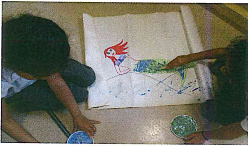
Reception 2 are drawing and painting pictures such as fairies and mermaids.