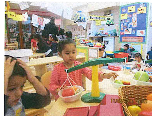
Nursery have been learning about weight and balancing in their fruit and vegetable shop.