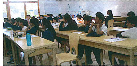
Year 6 are having their final preparations for their SATs. We wish them luck!