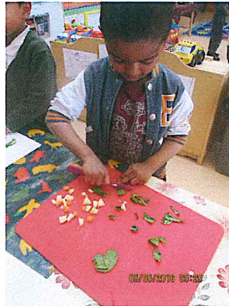
Nursery are making and eating a healthy vegetable soup with: potatoes, peppers, sweet corn, spinach and carrots.