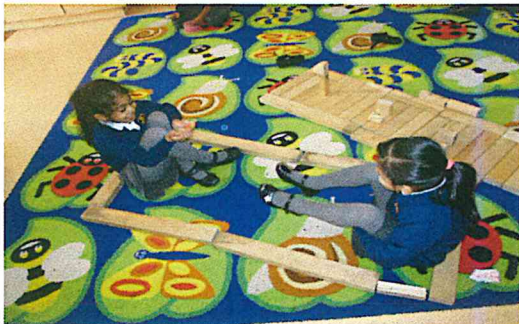
Reception 1 are taking on the role of mermaids on the rocks near Captain Hook's ship.