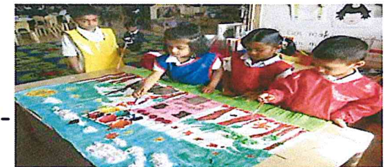
Reception 2 are creating a new Neverland for Peter Pan.