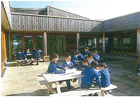
Year 1H are inventing silly words to make a giant's rucksack poem