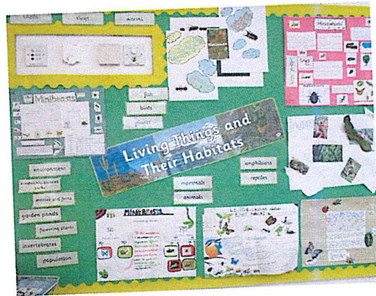
Year 4 are learning about living things and their habitats