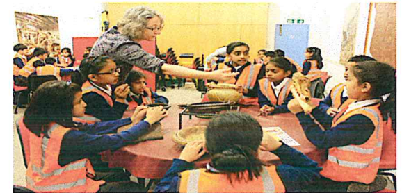
Year 3 are learning about The Romans at The Verulamium Museum in St. Albans.