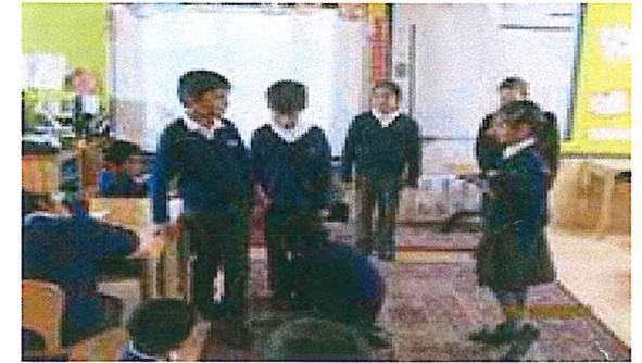
Year 2A are acting out the story of The Great Flood.