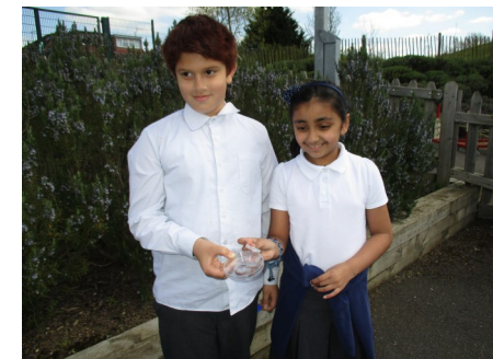
Year 4 went on a mini beast hunt in the school playground.