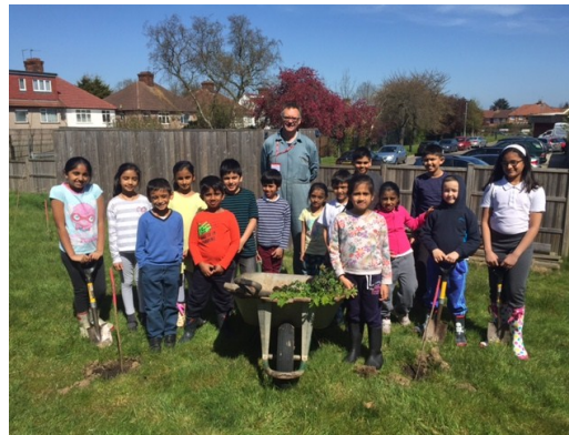
Our eco-councillors planted trees in our school playground.