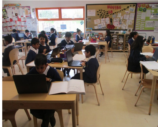
Year 5 are using the new laptops to do some cross curricular learning in Literacy.