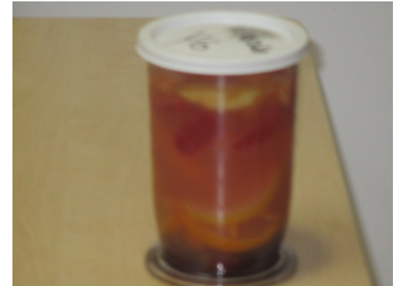
Here is a sample of the food products made by year 6 in their presentation for 'Help Yourself Day.'