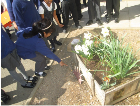
Year 1 are looking at the hedgehogs as they wake up from their hibernation.