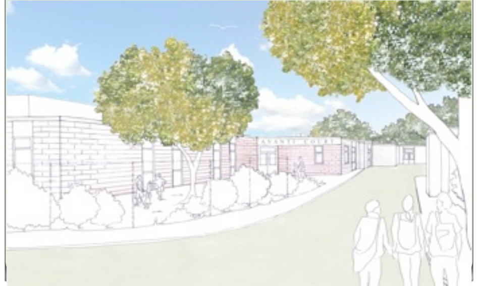
Artist image of Avanti Court

Monday 17th September: Reception children start. Parents/carers to stay all morning on first day.