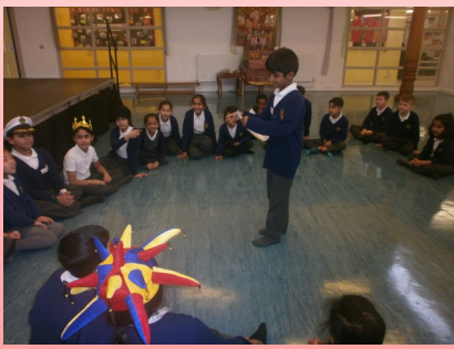
The whole school studied a play by William Shakespeare