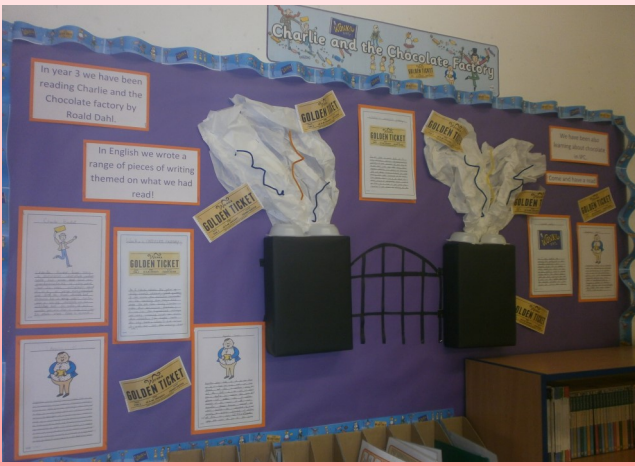
Displays celebrating significant British authors