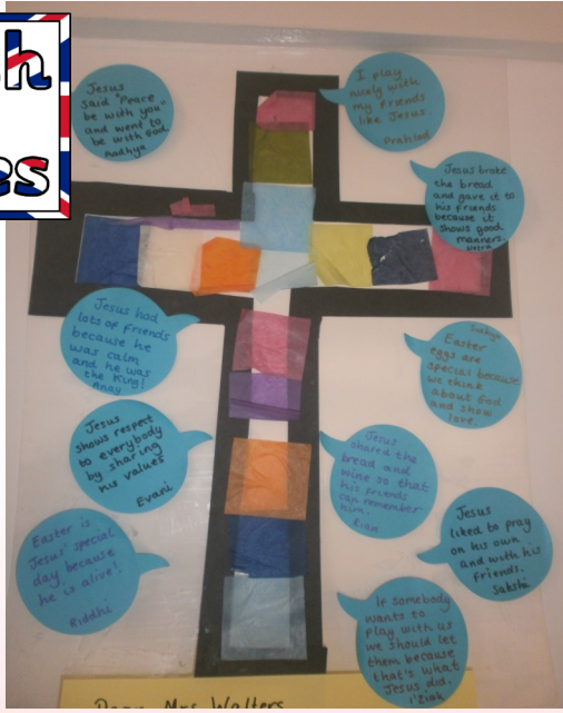
EYFS learn all about Jesus and Easter