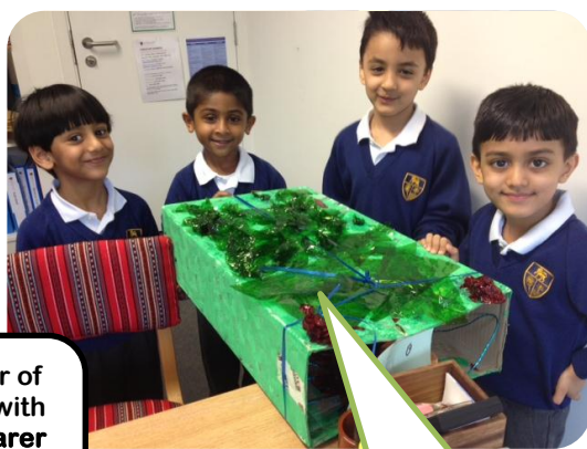
Four boys took over Mr Biddulph's office with their great green shark which they worked on together. It is wonderful to see children collaborating together, sharing and learning with each other. So much better than creating a competitive culture in learning!