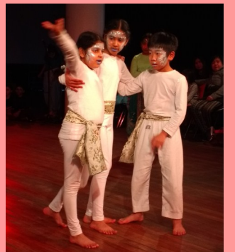
Avanti at the Southbank...