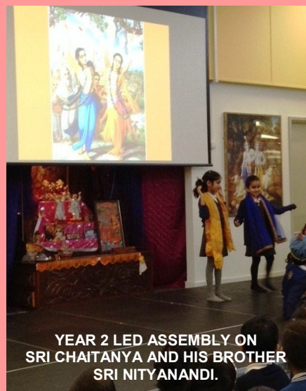
YEAR 2 LED ASSEMBLY ON SRI CHAITANYA AND HIS BROTHER SRI NITYANANDI.