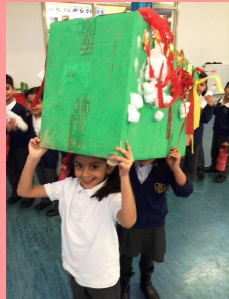
CHINESE NEW YEAR DRAGON!