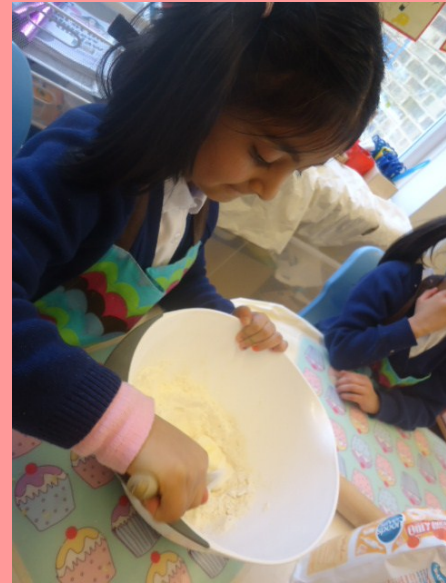
BOYS AND GIRLS LEARN TO COOK AT AVANTI COURT