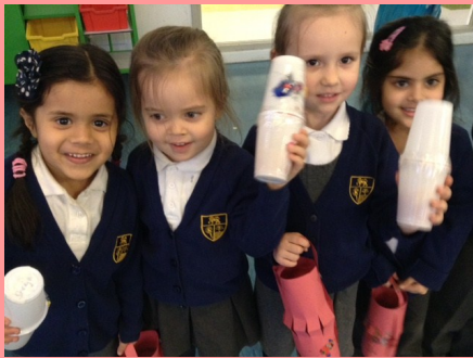
HAPPY CHILDREN AT AVANTI COURT SCHOOL