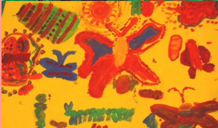
ART WORK WHICH WILL ADORN THE ANTENATAL UNIT OF KING GEORGE'S HOSPITAL.