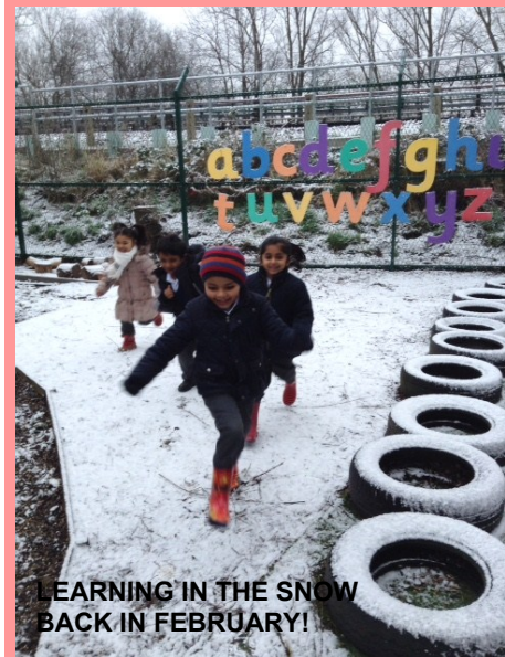
LEARNING IN THE SNOW BACK IN FEBRUARY!